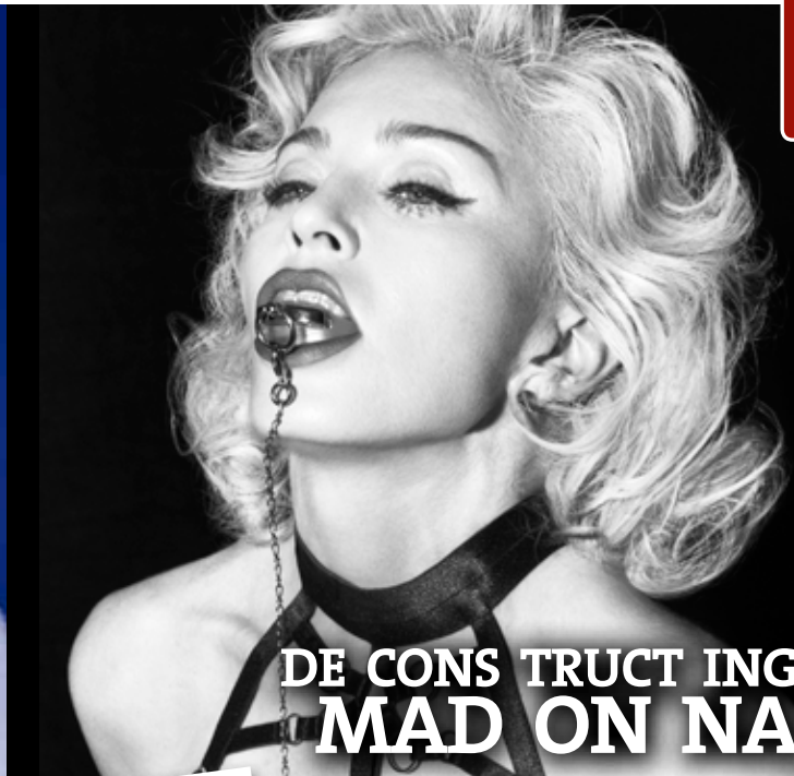
DE CONSTRUCTING MAD ON NA