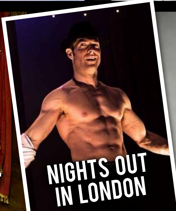
NIGHTS OUT IN LONDON