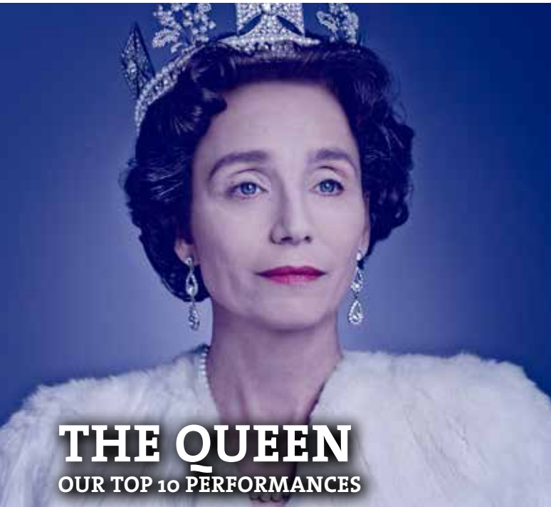
THE QUEEN OUR TOP 10 PERFORMANCES