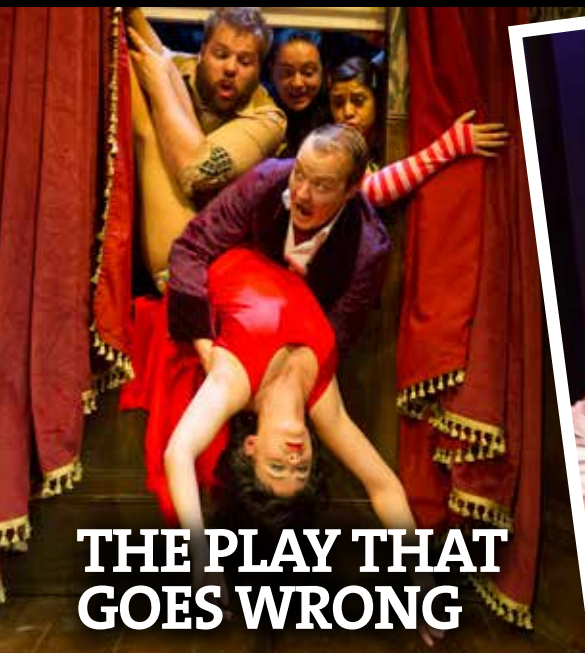
THE PLAY THAT GOES WRONG