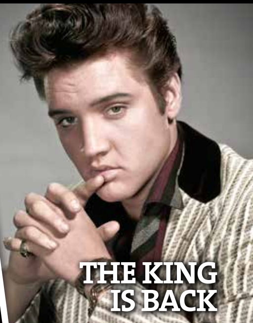
THE KING IS BACK